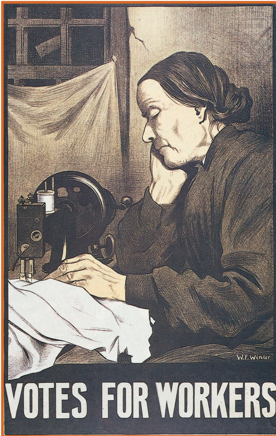
Cover Image/Image 3: Suffragette Poster Campaign. Designed by W.F. Winter, printed by Carl Hentschel, published by the Artists' Suffrage League.