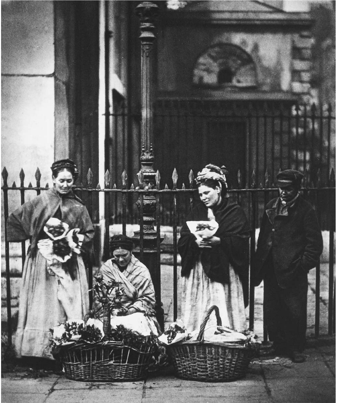
Cover Image: John Thomson, "Flower Market Women and 'Corduroy,' Covent Garden." Reprinted with permission from London's Transport Museum/Transport for London.