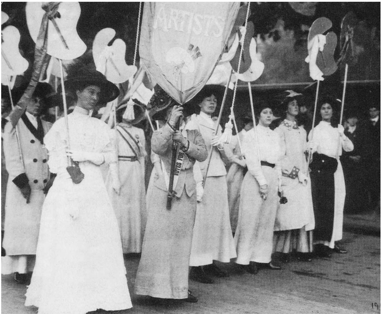
Images 2: Suffragette Marches. From Lisa Tickner, The Spectacle of Women .